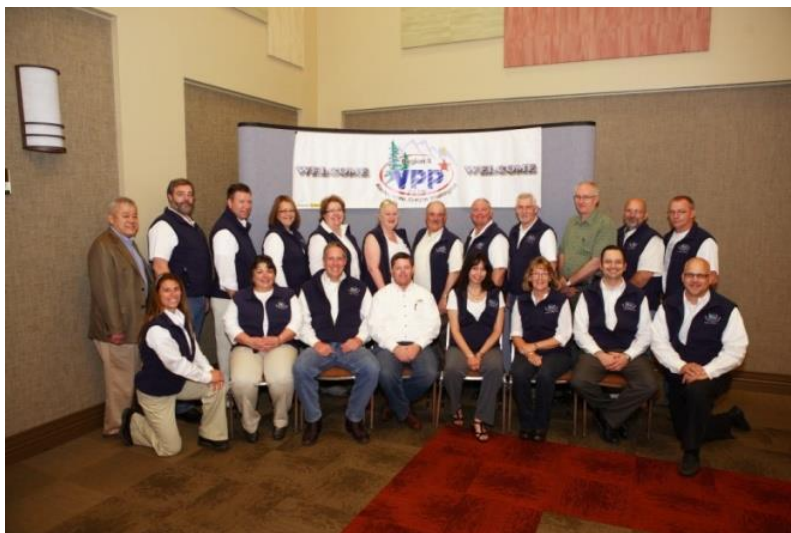
2011/2012 Region X Conference Planning Committee