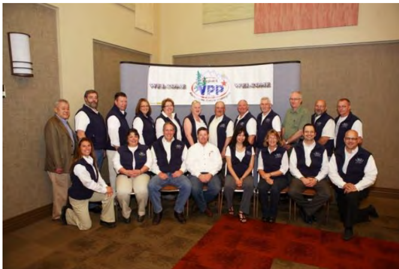
2011/2012 Region X Conference Planning Committee