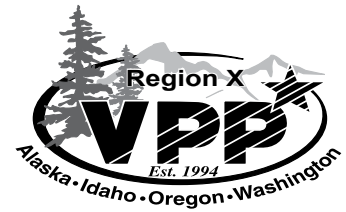
EXHIBIT INFORMATION AND RULES

May 1-3, 2018 • The Dena'ina Center • Anchorage, Alaska